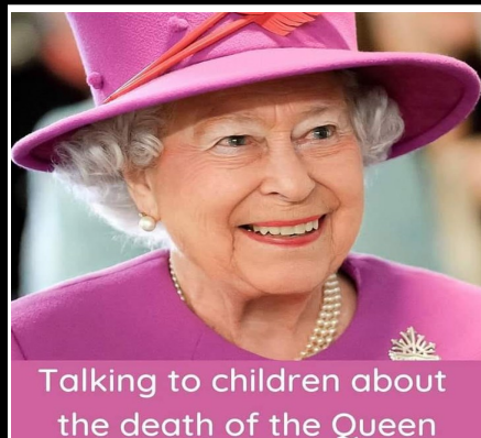
Talking to children about the death of the Queen