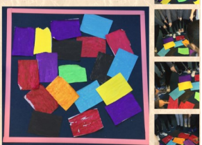
Creating a piece of large-scale collaborative art

In Art , we have created a large scale collaborative picture based on the Matisse classic collage of "The Snail"