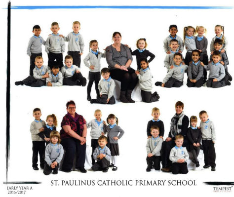
EARLY YEAR A 2016/2017